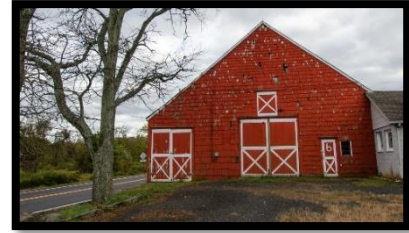
Historic Dutch barn at Blackwells Mills, New Jersey, on the Trail.