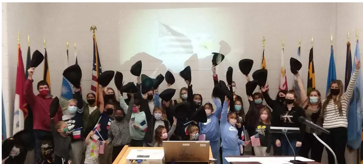
Huzzah! Participants wave their tricorn hats at the jubilant conclusion of the program.

For 2022, the Education Committee is developing a pilot project geared to eighth-graders in Baltimore City Schools.