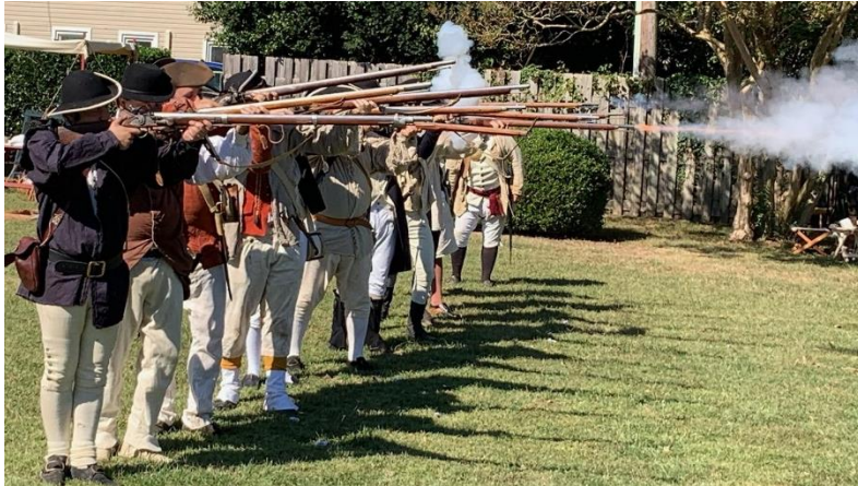
Re-enactors fire a volley during the commemoration of the Battle of the Hook.