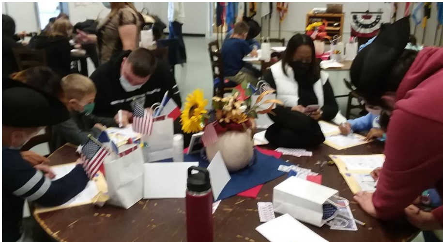
Students, with a little help from parents and members of the Teacher Academy of Maryland, work on projects in the activity book.