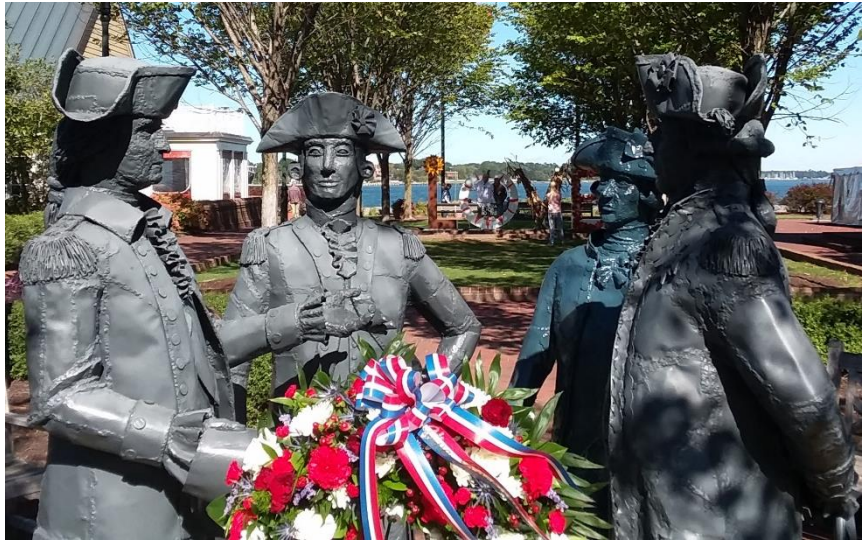
The gleaming new statue of Rochambeau, second from right, joins Washington, left, Lafayette and de Grasse on the Yorktown Riverwalk.

A long-awaited statue of General Rochambeau was unveiled and dedicated on the Yorktown Riverwalk on Oct. 18, accompanied by poignant remarks about the man as well as the commander. The statue, whose ceremonies were delayed a year by the Covid-19 pandemic, joined statues of General Washington, Admiral de Grasse and General Lafayette.