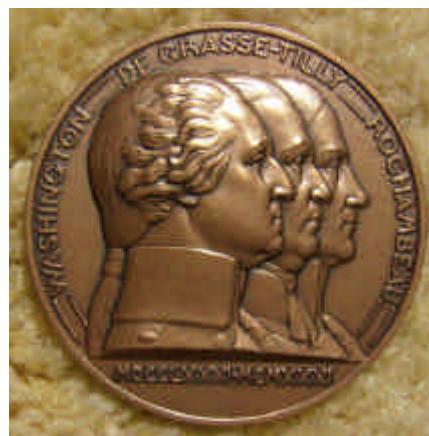
Medallion commemorating the 150th anniversary of the 1781 Victories at Sea and at Yorktown