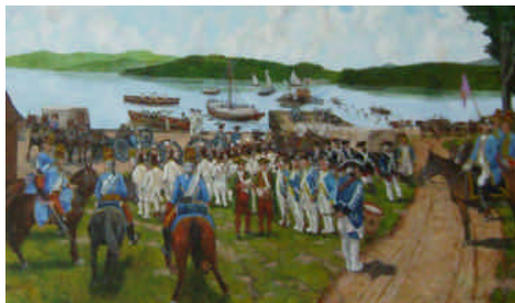
French troops crossing the Hudson River at Verplanck's Point (Kings Ferry)